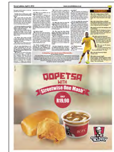
examples of previous placements