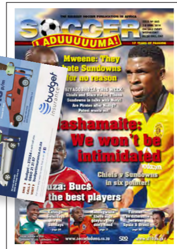
examples of previous placements