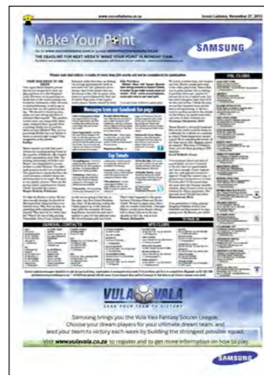
examples of previous placements