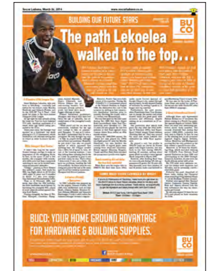
examples of previous placements